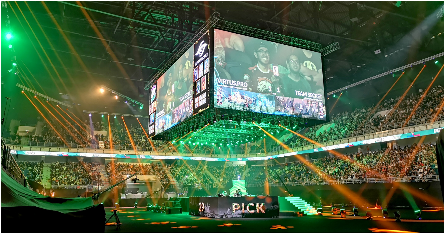
The Kuala Lumpur Major, an eSports tournament co-organised by eGG Network attracted thousands of Dota 2 fans

by purchasing a World Cup pass via our NJOI Now OTT. Football fans also rejoiced to hear we secured exclusive rights to the Premier League up to the end of the 2021/22 season.