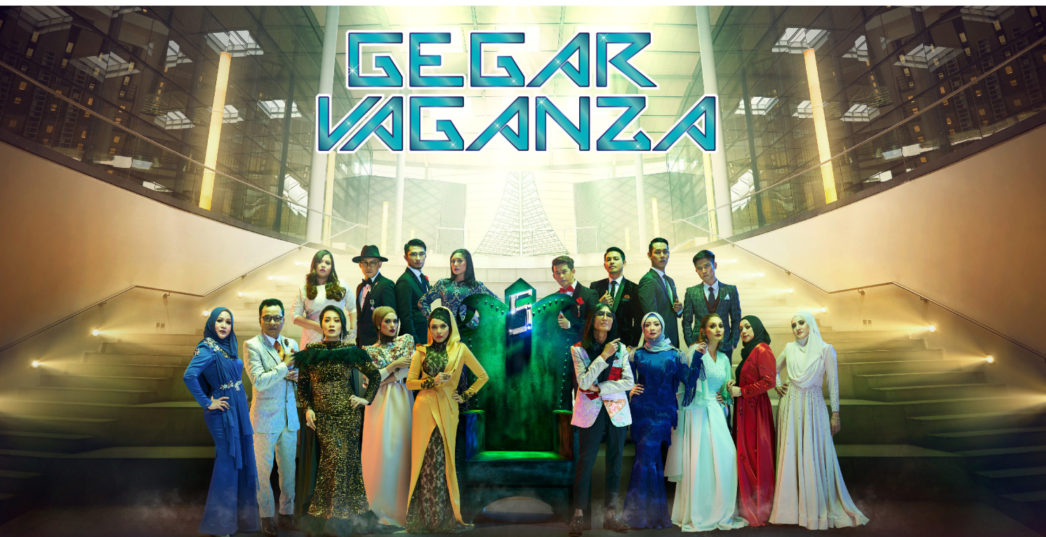
Our signature vernacular content continues to resonate with audiences on all platforms

2018 was our biggest sporting year yet with live coverage of the 2018 FIFA World Cup, Winter Olympics, Commonwealth Games and Asian Games. As the home of sports, we brought all 64 World Cup matches live in HD to all sports fans. The World Cup saw 11.6 million and 1.0 million unique viewers on TV and OTT respectively, with 120,000 World Cup passes sold. For the first time ever, we extended our sports proposition to all Malaysians, enabling them to stream